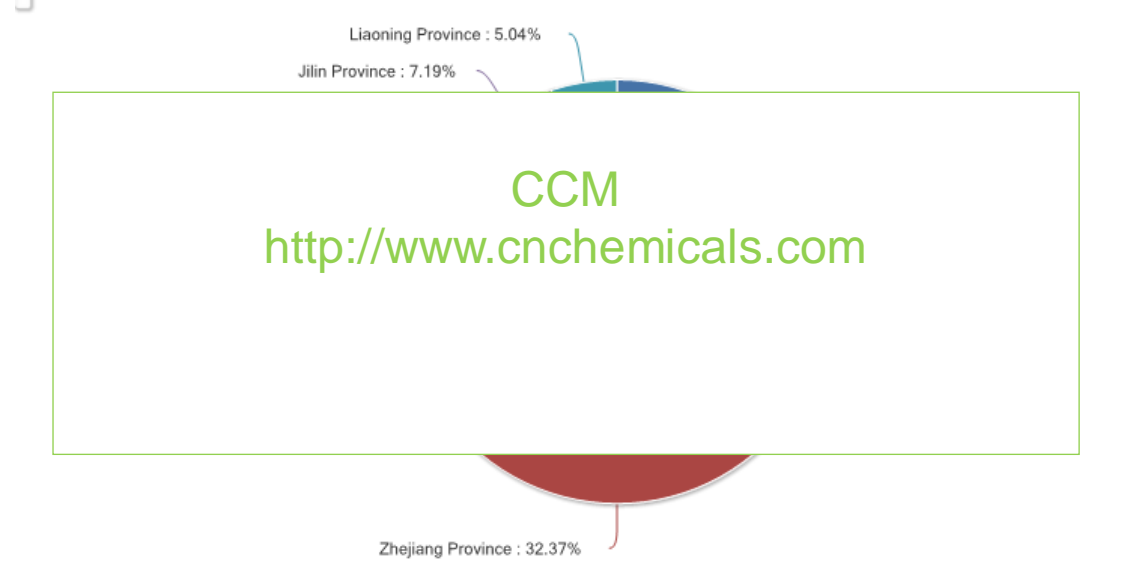
Figure 3.1-2 Distribution of capacity of atrazine technical in China by region, 2017