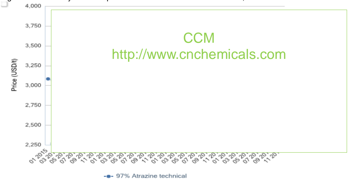
Figure 4.2-3 Monthly ex-works price of 97% atrazine technical in China, Jan. 2015-Nov. 2018