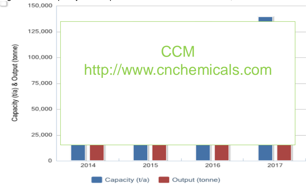
Figure 3.1-1 Capacity and output of atrazine technical in China, 2014–2017