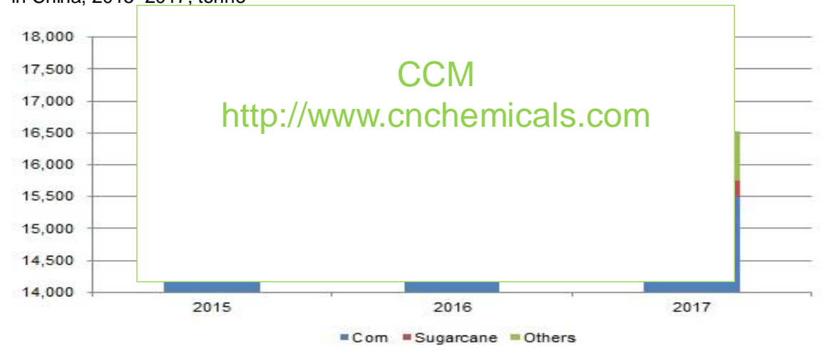
Figure 5-1 Actual consumption structure of atrazine formulations (converted to 97% technical) by crop in China, 2015–2017, tonne